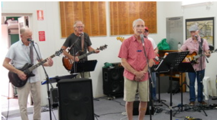
Five shades of wonderful...