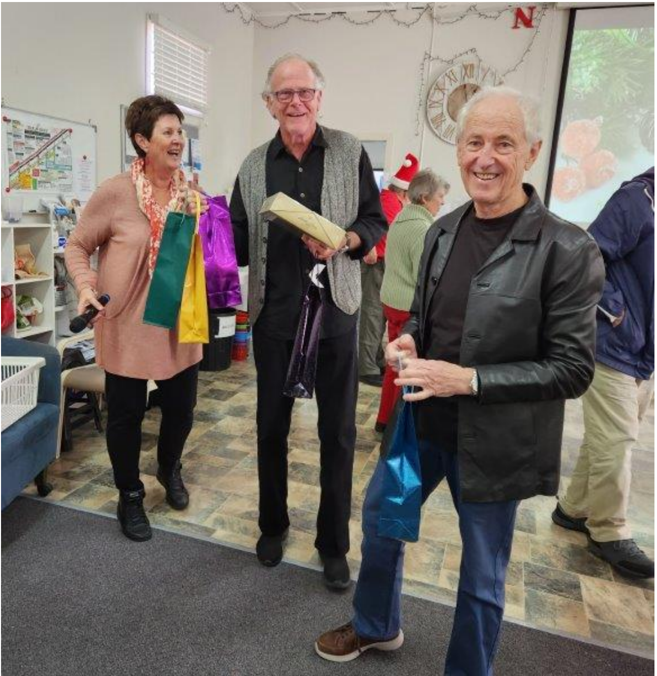
we had pixies and elves and happy people dancing to the best boy band on the Coast Five Shades of Gray (above).