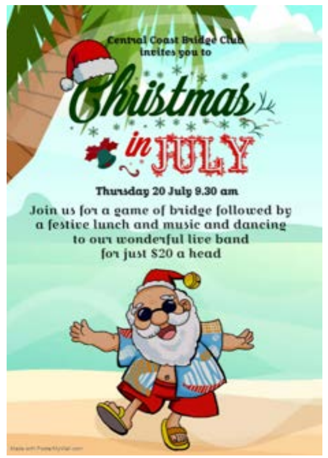
Thursday this week!