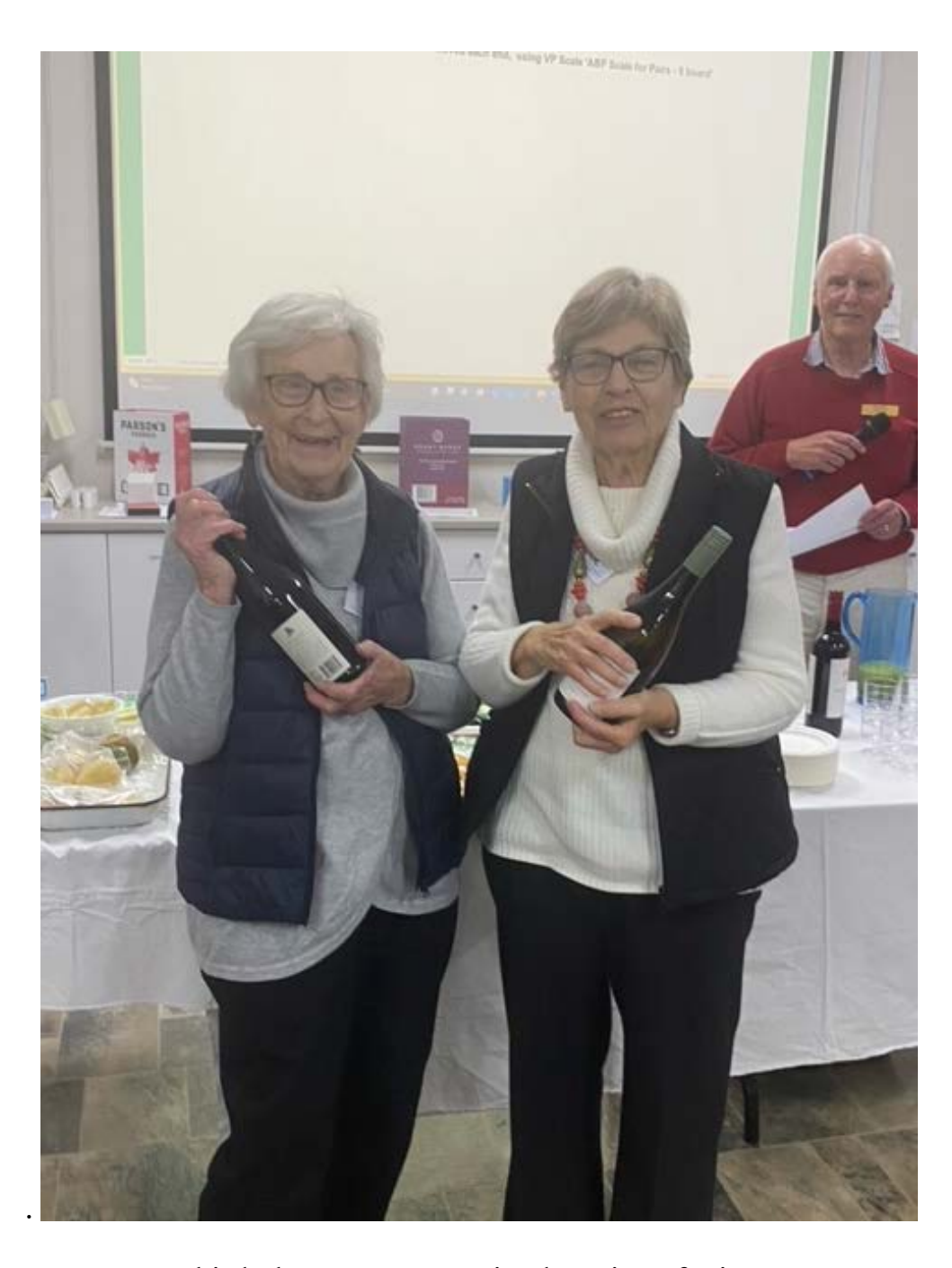
Third place-getters received a prize of wine.